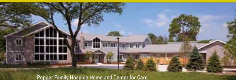
Pepper Family Hospice Home and Center for Care

Hospice & Palliative Care of Northeastern Illinois located at: